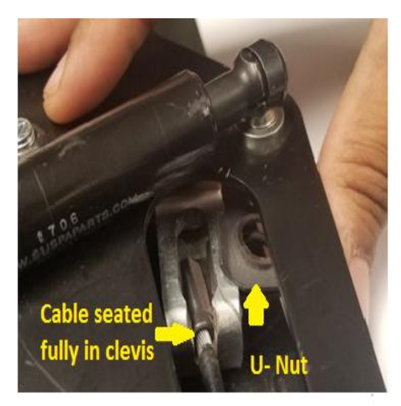
Figure 3 – Cable Seating