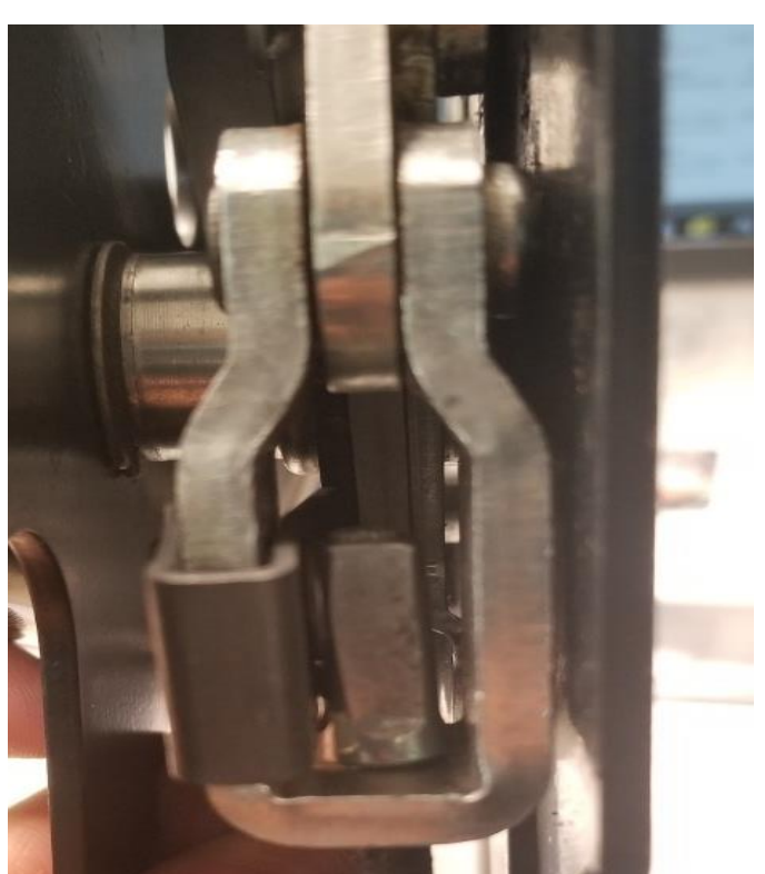
Figure 5 – Fully Assembled