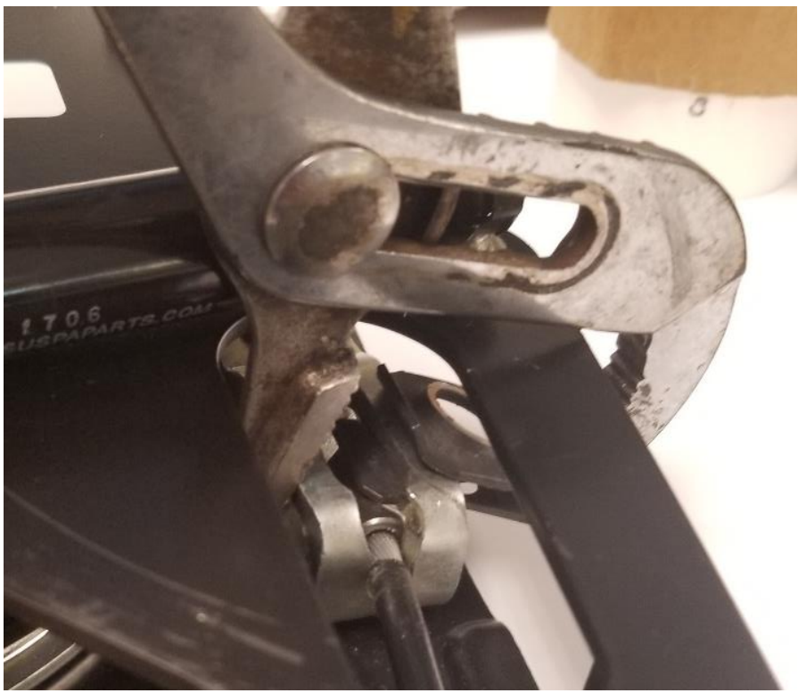
Figure 4 – U-Nut Installation