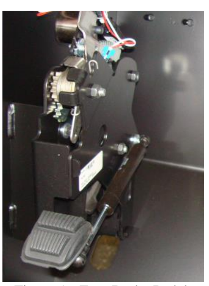
Figure 1 - Foot Brake Pedal