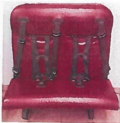
500-094 ICS LOWER BELT BUCKLE