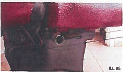
#600-640, CUSHION KEY PLUNGER