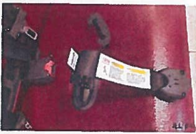
#500-094, ICS LOWER BELT BUCKLE GROMMET