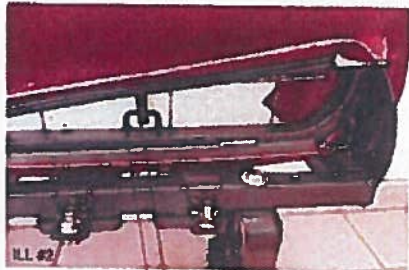
#500-094, ICS LOWER BELT CLIP CUSHION FRAME ICS ROD