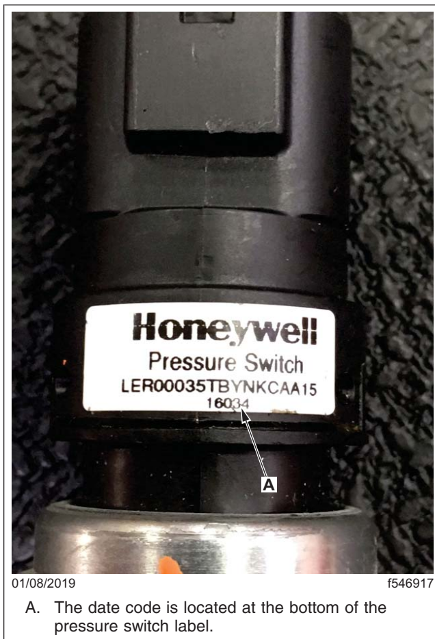
Fig. 2, Brake Light Pressure Switch Date Code