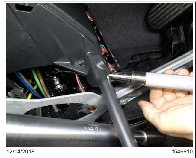
Fig. 3, Tightening the Brake Light Pressure Switch