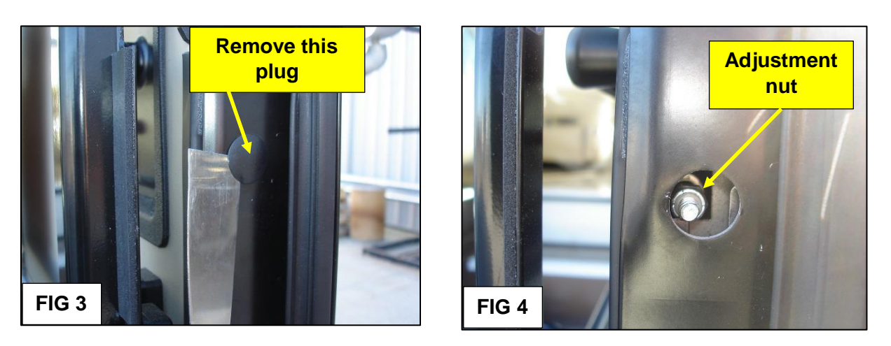
FIG 3 & 4:

FIG 2: The serial number is a blue 6 number ID above the door manufacturer's label.