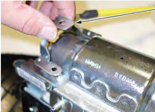
INFLATOR BRACKET Do not reuse.

You can only remove one of the brackets, as the other is welded to the airbag housing.