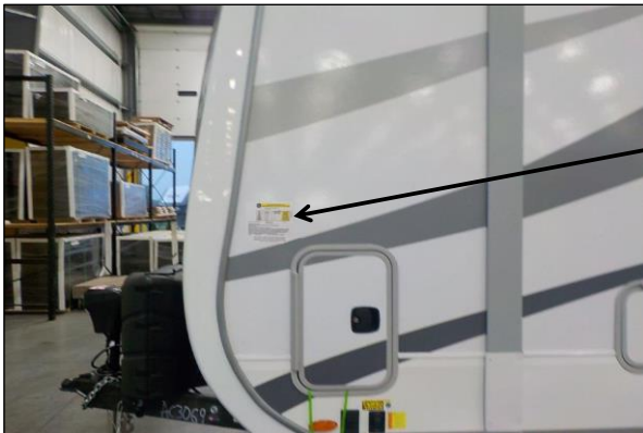
FRONT RIGHT OFF DOOR SIDE (ODS)

DO NOT COVER GRAPHICS OR LOGOS ON THE EXTERIOR OF THE TRAILER WITH NEW LABEL