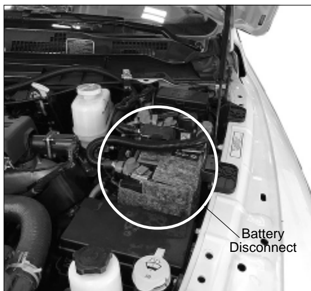
Figure 1 — Driver Side Mounting

Altec requires that both lead acid battery disconnects (refer to Figures 1 and 2) be replaced on all affected chassis at the next service interval but no longer than 60 days after receiving this CSN. Order the Lead Acid Battery Disconnect Bracket Kit, part number 990699917, by calling 1-877-GO ALTEC (1-877-462-5832).