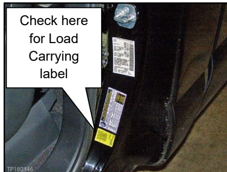
Figure 3 (Single Cab)