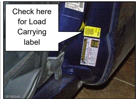
Figure 4 (King Cab)