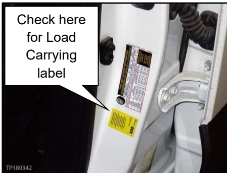
Figure 2 (Crew Cab)

If present, the Load Carrying Capacity Modification label will be located above the existing Tire and Loading Information label on the driver's side rear passenger door.