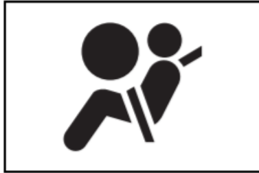
Airbag Warning Light

If this condition has occurred in your vehicle, the Airbag warning light will illuminate. In addition, the Front Passenger Airbag Status Indicator Light may continuously show "OFF", even if there is an occupant in the front passenger seat. If you see these warning lights, you may be experiencing the condition described above. You should contact your local authorized Lexus dealer for diagnosis and appropriate repair as soon as possible.