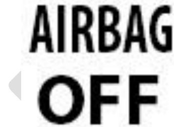
Front Passenger AIRBAG Status Indicator Light

The Airbag Warning Light is designed to come on when the engine switch is turned to the "ON" position during the ignition cycle check function. Under normal operation it deactivates after a few seconds. The warning light turning off after the check period means the system is operating as designed. Please refer to the Owner's Manual for additional operation details related to this system.