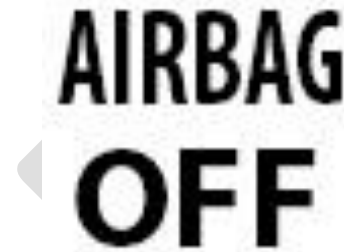
Front Passenger AIRBAG Status Indicator Light

The Airbag Warning Light is designed to come on when the engine switch is turned to the "ON" position during the ignition cycle check function. Under normal operation it deactivates after a few seconds. The warning light turning off after the check period means the system is operating as designed. Please refer to the Owner's Manual for additional operation details related to this system.