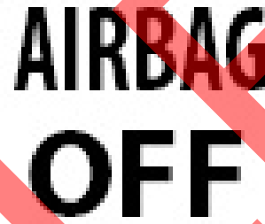
Front Passenger AIRBAG Status Indicator Light

The Airbag Warning Light is designed to come on when the engine switch is turned to the “ON” position during the ignition cycle check function. Under normal operation it deactivates after a few seconds. The warning light turning off after the check period means the system is operating as designed. Please refer to the Owner’s Manual for additional operation details related to this system.