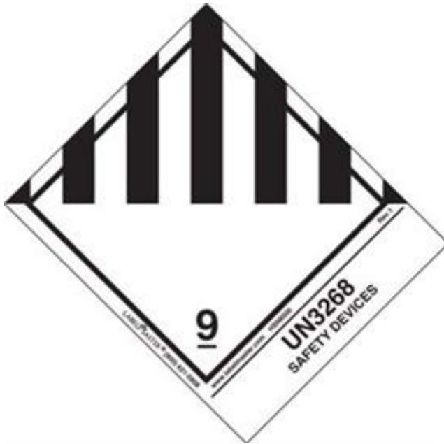
Safety Device Label