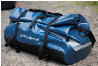
BMW Luggage Roll (77 49 8 550 346 MSRP $259)