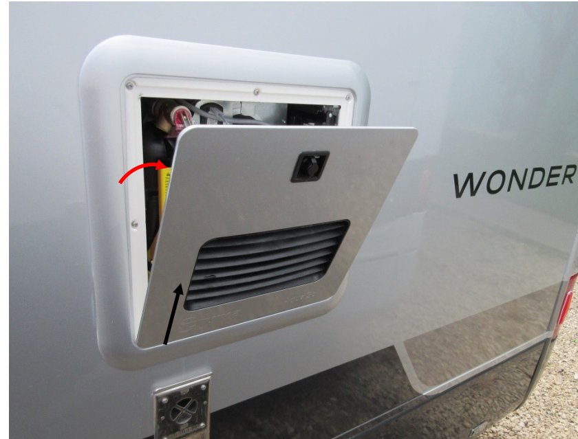
Pull top of door out, lift door out of bottom slots.