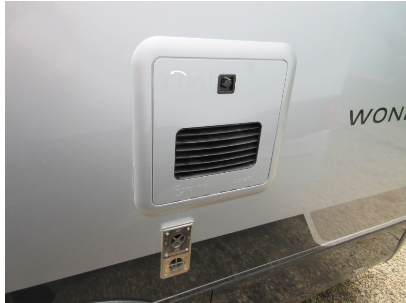
Unlatch door .