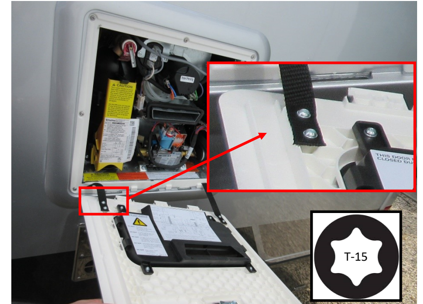
Remove the two T-15 screws for each strap from the water heater door.