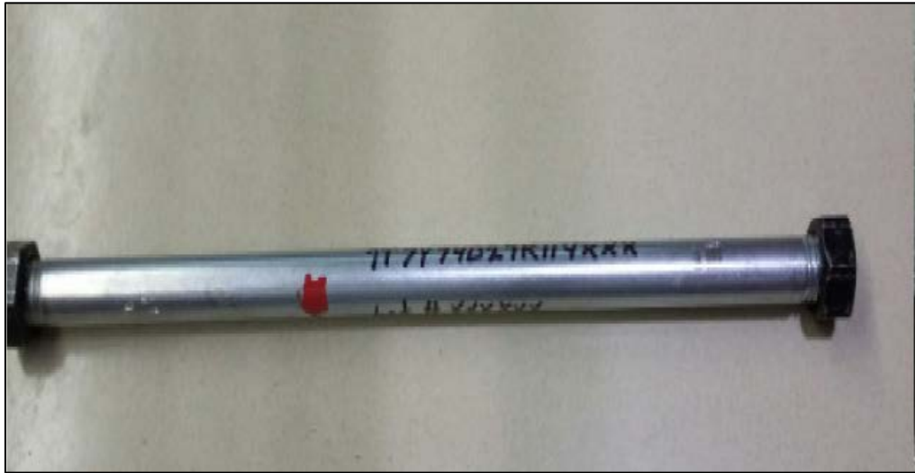
Figure 4: Removed Mounting Rod Ready for Shipment to IMMI