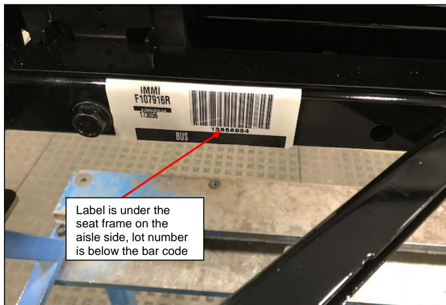
Figure 3: Label on the Seat Frame Rail with the Lot Number