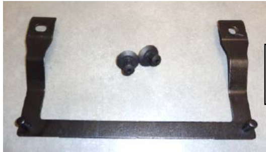
1-Piece Metal Retention Bracket and retaining clips (2)