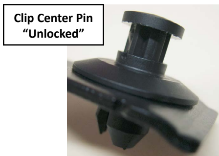
Clip Center Pin "Unlocked"