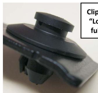
Clip Center Pin "Locked" and fully seated.