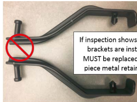
If inspection shows these plastic brackets are installed, they MUST be replaced with the 1-piece metal retainer bracket.