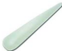
Trim Removal Wedge -3409- (or equivalent)