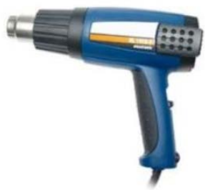
Wiring Harness Repair Set Hot Air Blower -VAS1978/14A- (or equivalent)