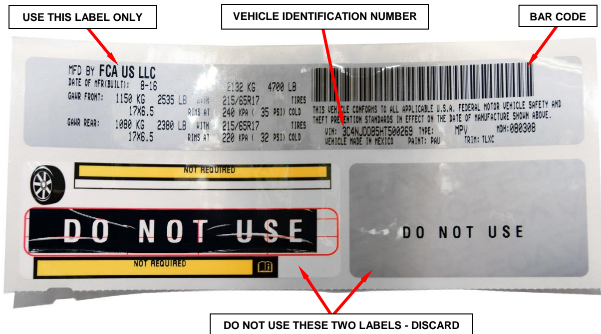
Figure 2 – Certification Label