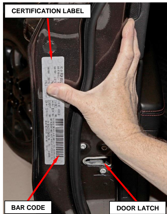
Figure 6 – Install Certification Label