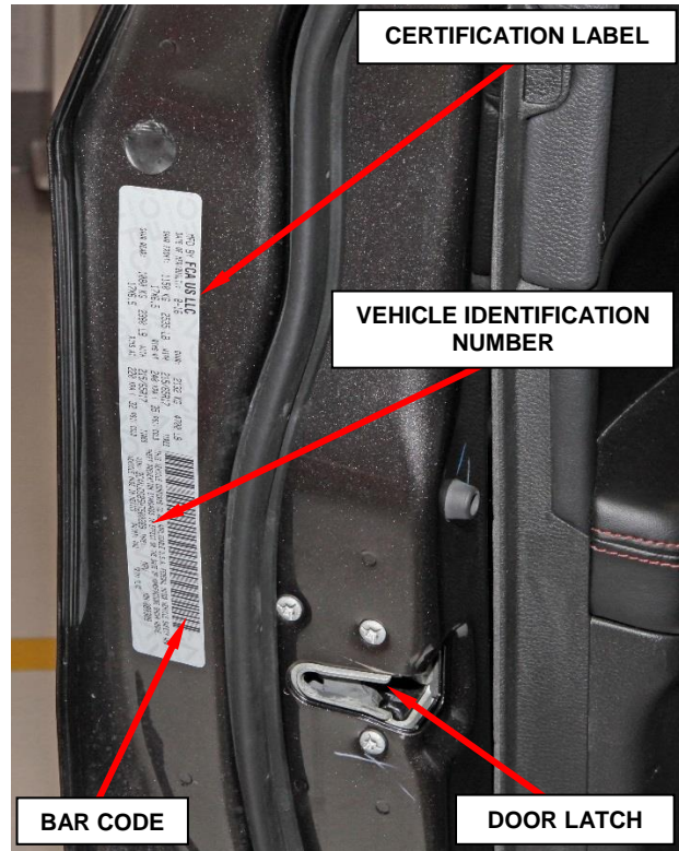
Figure 1 – Certification Label Location

NOTE: If the VIN on the new label does not match the VIN on the original label, the recall cannot be completed at this time. Contact the Business Center for your market to obtain the correct certification label.