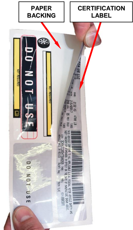
Figure 5 – Remove Certification Label From Paper Backing