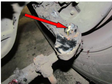
Paint Mark to Identify Nut Rotation