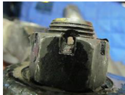
Cotter Pin Hole Position