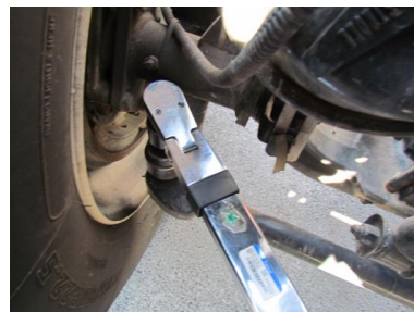
Check Nut Torque – Do Not Exceed 170 ft. lbs.