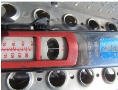
Retorque to 130 ft. lbs