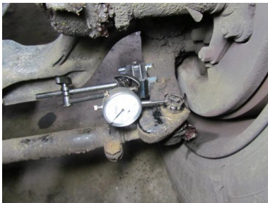
Dial Indicator Mounting Position