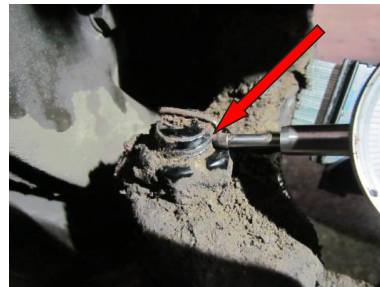
Dial Indicator Tip Must be Placed on The Stud