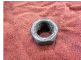
Back of Tie Rod Nut