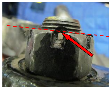
Cotter Pin Hole at Maximum Height