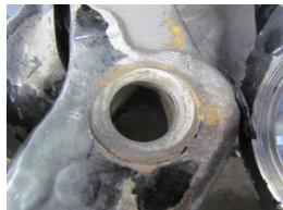
Tie Rod Arm Taper Bore