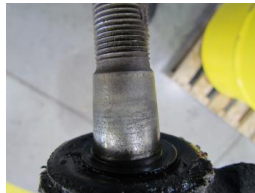
Tie Rod End Taper Stud