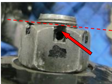
Good Cotter Pin Hole Position