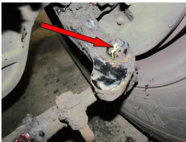
Paint Mark to Identify Nut Rotation