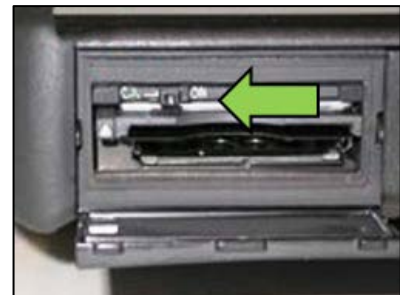
VAS 6150C (Left side behind SC/EX door)