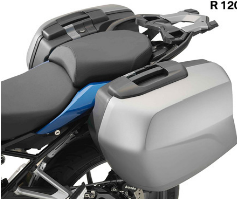
R 1200 RS