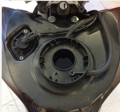
FIG. 1: Displays the tank with the attachment parts removed.

COPYRIGHT NOTICE: The user acknowledges that all components of this technical information are KTM's and/or third parties' copyright protected property. Alteration, assignment, distribution and reproduction are forbidden.