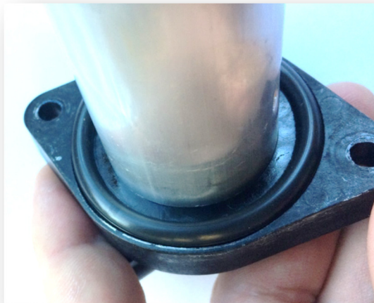
FIG. 3: Displays the new seal on the fuel tank sensor.

COPYRIGHT NOTICE: The user acknowledges that all components of this technical information are KTM's and/or third parties' copyright protected property. Alteration, assignment, distribution and reproduction are forbidden.