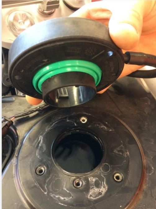
FIG. 2: Displays the new filler neck insert with new the seal.