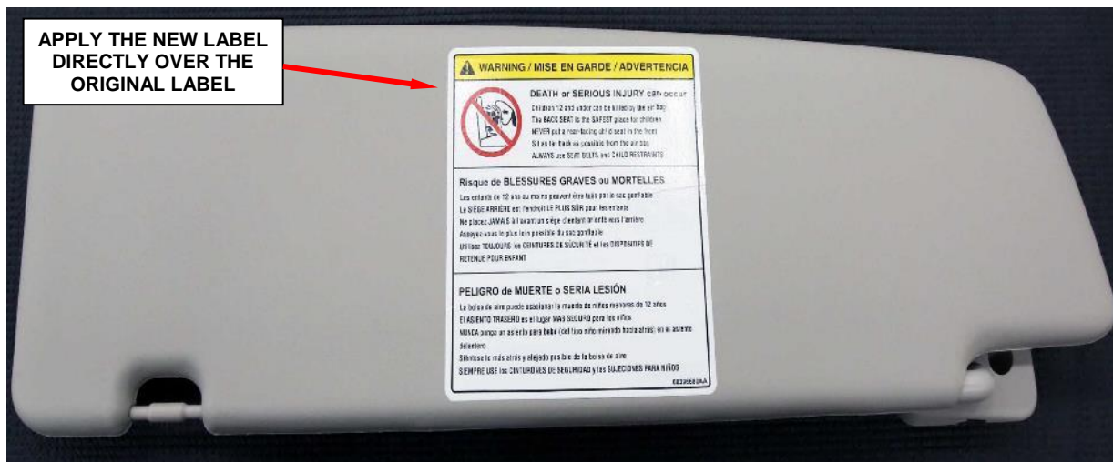
Figure 1 – Sun Visor Safety Label (Left-Side Shown)