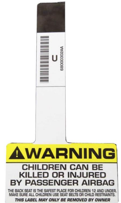
Figure 2 – Dashboard Hangtag Label