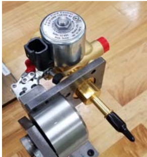
SUPPLY & RETURN FIXTURE

Step 002 Remove coil nut from sleeve using Red torque wrench with 14mm socket by rotating counterclockwise. IMPORTANT: If back-off torque exceeds the ability of the torque wrench, then set the part aside.