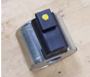
REPLACEMENT COIL (NOTE YELLOW DOT)

Step 006 Place Coil Alignment Block on top of coil and rotate coil as needed to fit block (Supply and Return). For FRPCM push coils up against coil cut-out attached to clamp. Torque coil nut using Red torque wrench with 14mm socket by rotating clockwise. Full torque is achieved when wrench clicks.