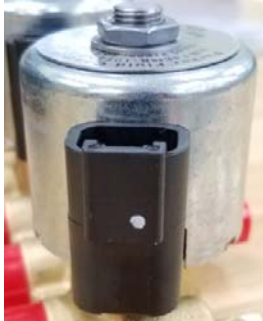
OLD COIL (NOTE NO DOT OR WHITE DOT)

Step 004 Torque sleeve by rotating Blue torque wrench clockwise. Full torque is achieved when wrench clicks.