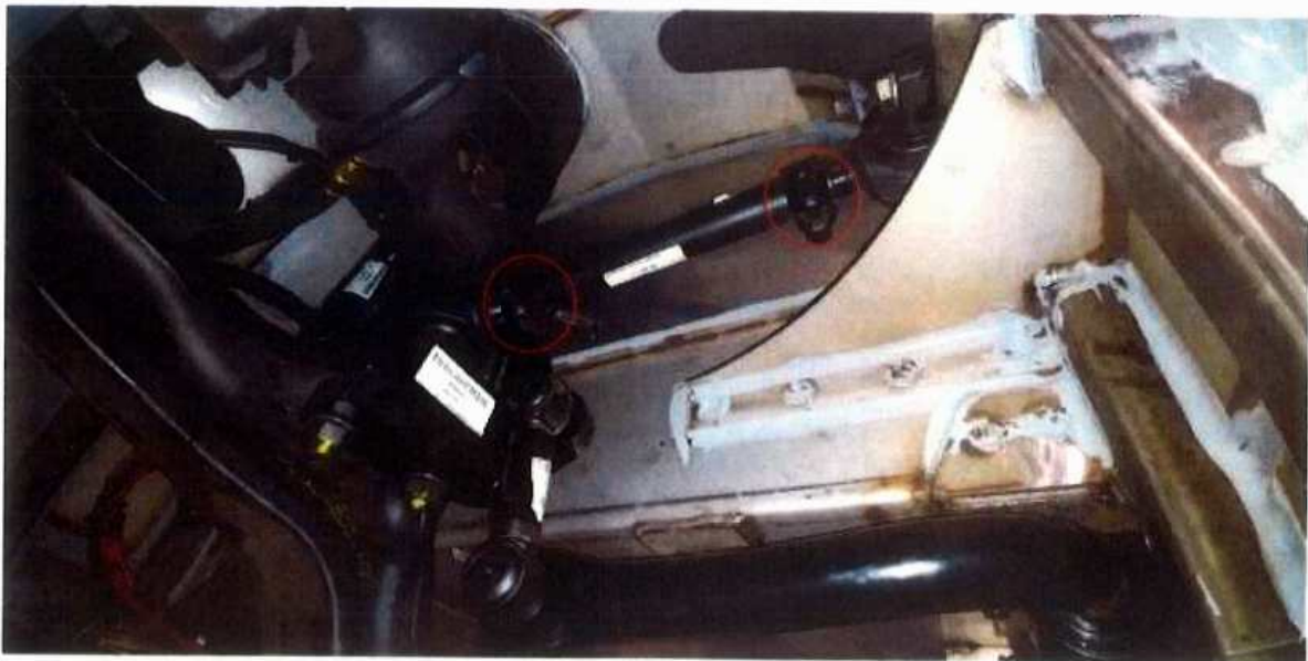
Front Suspension V links - Upper