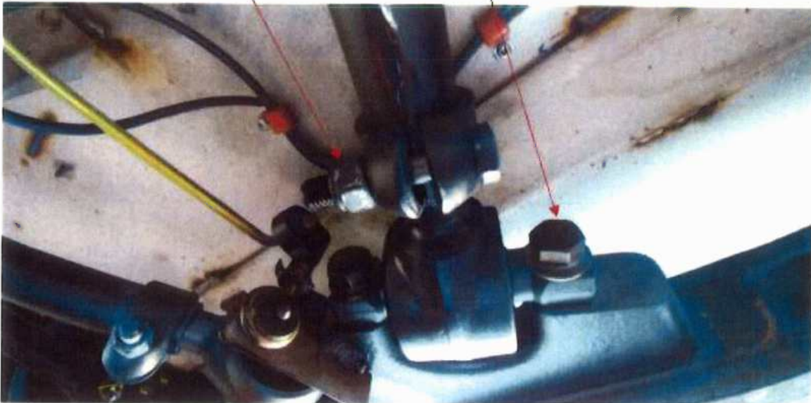
Typical view of Suspension Link and Clamp