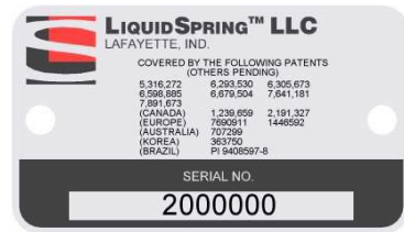
Figure 3. Serial Plate

If you are unable to have your vehicle remedied without charge and in within a reasonable time, you may submit a complaint to the Administrator, National Highway Traffic Safety Administration, 1200 New Jersey Ave., S.E., Washington, D.C., 20590; or call the toll-free Vehicle Safety Hotline at 1-888-327-4236 (TTY: 1-800-424-9153); or go to http://www.safercar.gov .