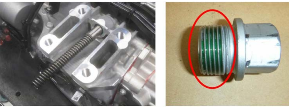
Figure 4 – Installation of Range Shift Fork Detent Spring Nut Cap

7. Apply Loctite 263 or 270 to the threads of the range shift fork detent spring nut cap and reinstall the detent, spring and nut cap into the transmission. You will need to push on the nut cap towards the transmission to compress the spring (80 lbs) when installing it. Tighten the nut cap to 100 N·m (74 lb·ft). See Figure 4.