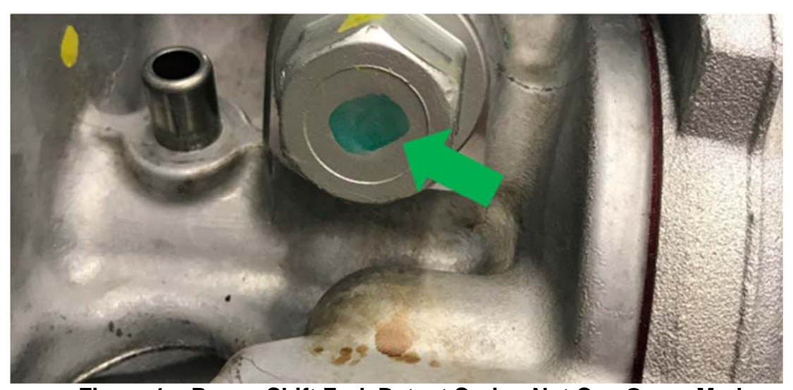
Figure 1 – Range Shift Fork Detent Spring Nut Cap Green Mark