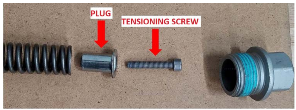
Figure 3 - Removal of Plug and Tensioning Screw

6. Remove the plug and the tensioning screw from the assembly and discard them. See Figure 3.