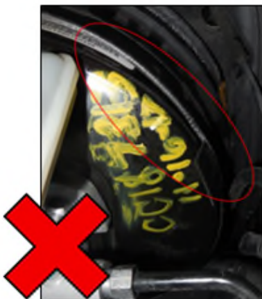
VIN/date written on the