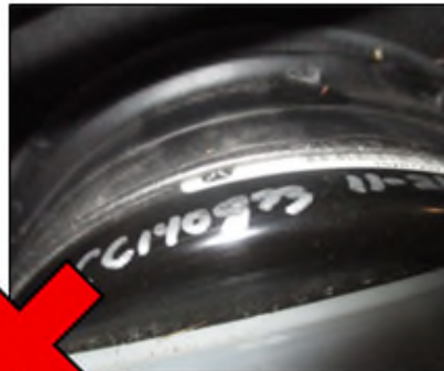
Picture does not show any tab