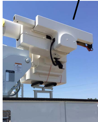
Jib Tilt and Extend Cylinder