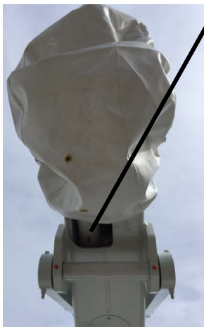
Boom Tip Leveling Cylinder