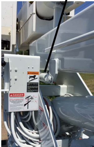
Master Leveling Cylinder