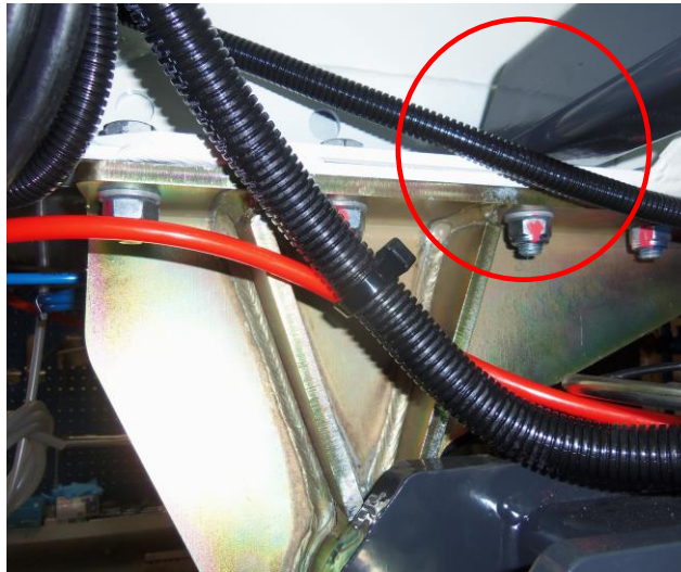
Figure 1 – Reaction beam fitted to left hand side of vehicle.