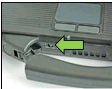
VAS 6150 & VAS 6150A (Front panel behind handle)