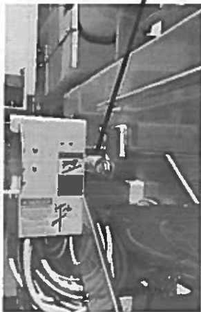
Master Leveling Cylinder