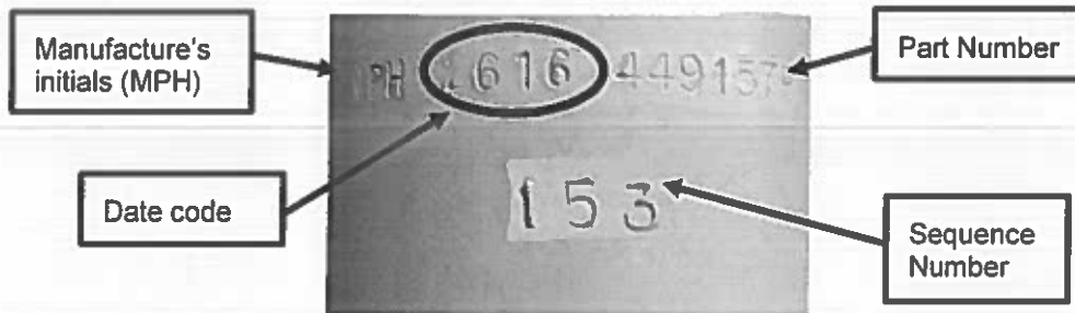
Figure B. Hydraulic Cylinder Date Code

The first two numbers in the date code are the week the cylinder was manufactured. The second two numbers are the year the cylinder was manufactured. Example 2616 was manufactured week 26 in 2016 (June 27 th , 2016). Sequence number 153 represents this was the 153 rd cylinder manufactured in week 26 in 2016.