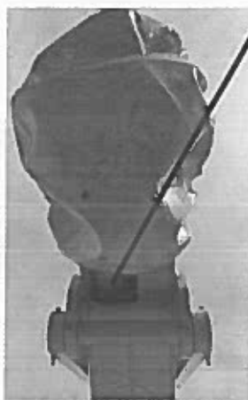
Boom Tip Leveling Cylinder