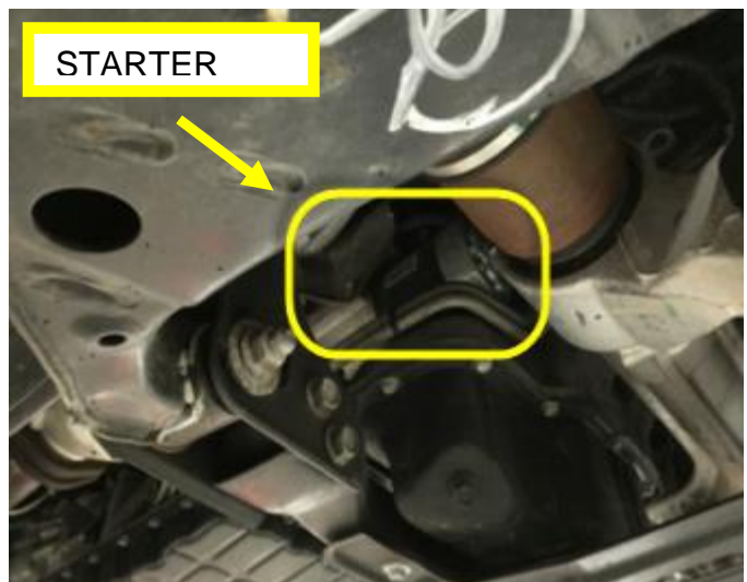
Figure 2 4 Wheel Drive