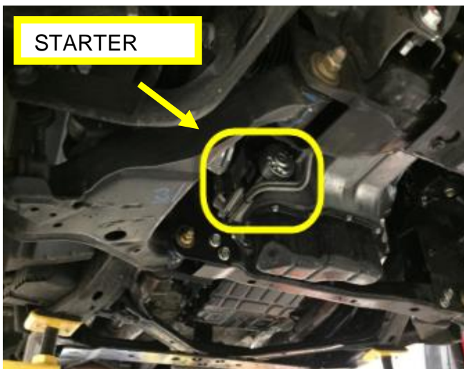
Figure 1 2 Wheel Drive