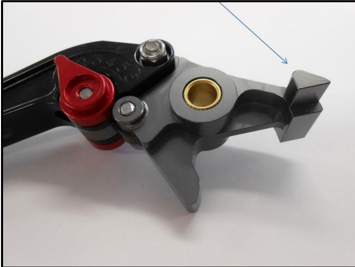
Original recalled lever assembly (no identification feature).

The recalled levers do not have machined feature and should be replaced: