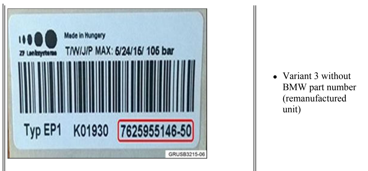
UPDATE! Table of unaffected Electro Hydraulic Power Assist (EHPAS) pump numbers