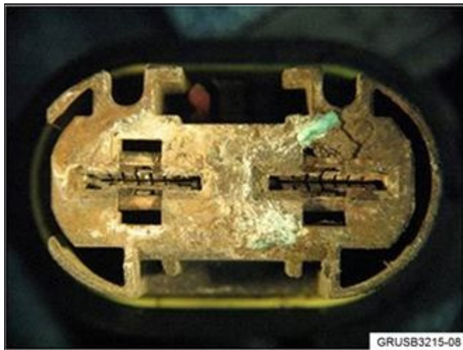
Connector with corrosion

YES - replace the additional wiring harness. Install the additional wiring harness in the same way as the existing wiring harness and connect to the power steering pump and fan.