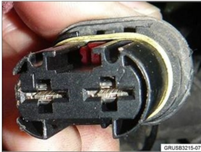
Connector without corrosion