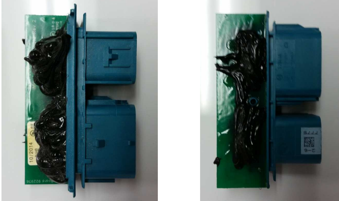
Figure 5: "SHUNT BLOCKS" – top view & bottom view

Special Work Instructions are intended for use by Professional Technicians only. They are written to guide Professional Technicians in performing service to vehicles of product specific nature in conjunction with industry standards. Professional Technicians are appropriately trained on industry standards and have the tools and equipment to perform procedures safely and properly.