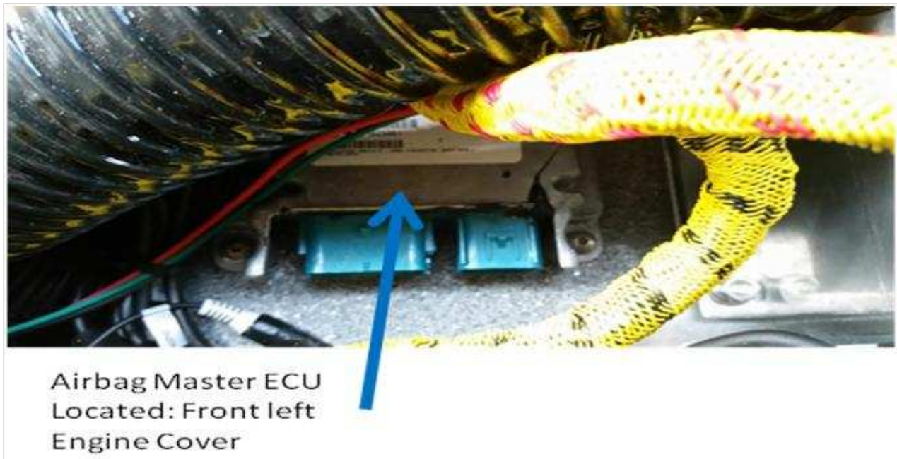
Figure 2: UNDER CENTER DASH, FRONT LEFT SIDE OF ENGINE COVER

Special Work Instructions are intended for use by Professional Technicians only. They are written to guide Professional Technicians in performing service to vehicles of product specific nature in conjunction with industry standards. Professional Technicians are appropriately trained on industry standards and have the tools and equipment to perform procedures safely and properly.