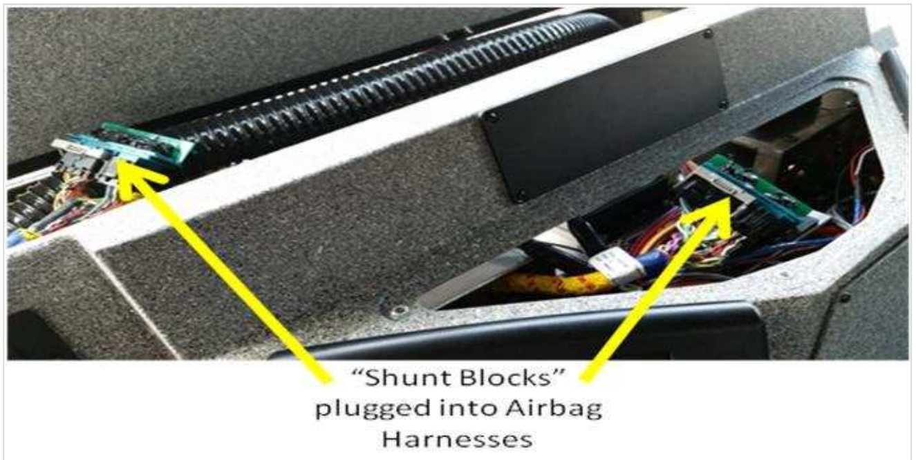
Figure 4: "SHUNT BLOCKS" INCORRECTLY LEFT IN AIRBAG HARNESSSES

Special Work Instructions are intended for use by Professional Technicians only. They are written to guide Professional Technicians in performing service to vehicles of product specific nature in conjunction with industry standards. Professional Technicians are appropriately trained on industry standards and have the tools and equipment to perform procedures safely and properly.