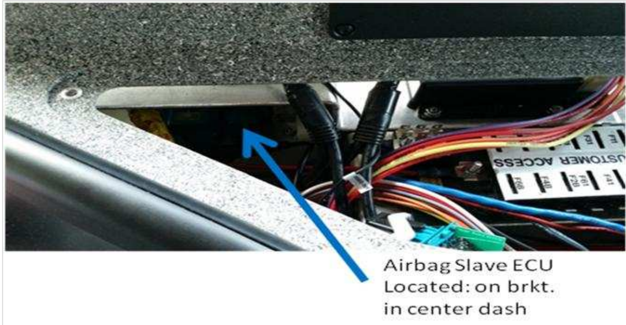
Figure 3: UNDER LOWER CENTER DASH COVER