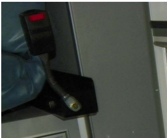
Nut and Bolt Assembly