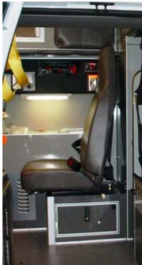
Threaded Nut Assembly