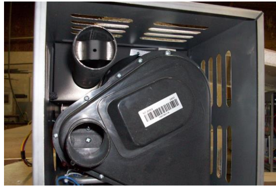
NT series Furnace