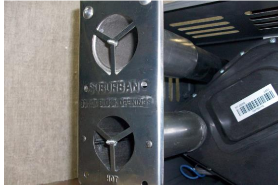
NT Series furnace with jig installed Fig 8

Use the supplied red grease pencil to color the screw threads at the center of the jig holes, (this will help to clearly mark the drill center location).