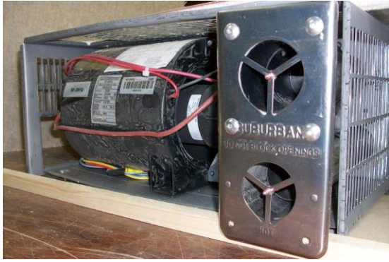
SF Series furnace with jig installed Fig 7