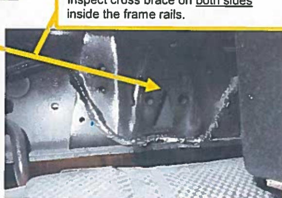
View of cross brace inside frame

Terex South Dakota, Inc. 500 Oakwood Road Watertown, SD 57201 USA (605) 882-4000 • Fax (605) 882-1842