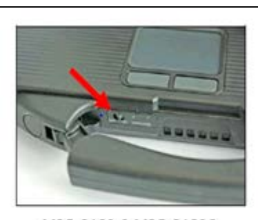
VAS 6150 & VAS 6150A (Front panel behind handle)