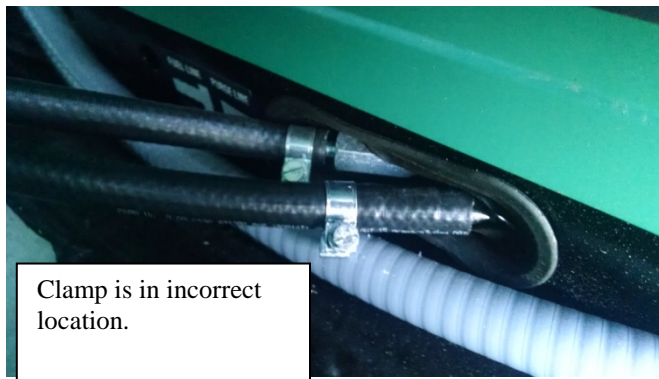
Figure 1 - Incorrect

Step 2 Look under the generator and inspect the incoming fuel line and clamp to the generator where the line attaches to the fuel filter. Verify the fuel line is fully engaged on the barb fitting and the clamp is in the proper position and it is tight. See Figure 1 & 2.