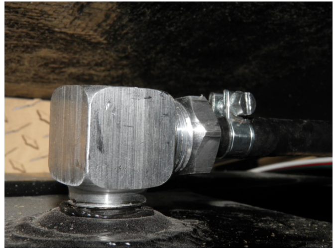
Figure 4 – Correct