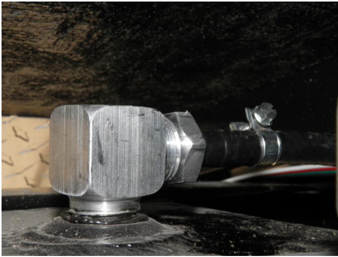
Figure 3 - Incorrect