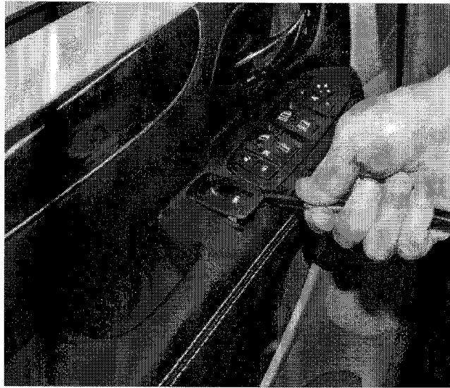
Fig. 1 Removing Window Vent Switch

Use the proper trim tool to remove the switch.