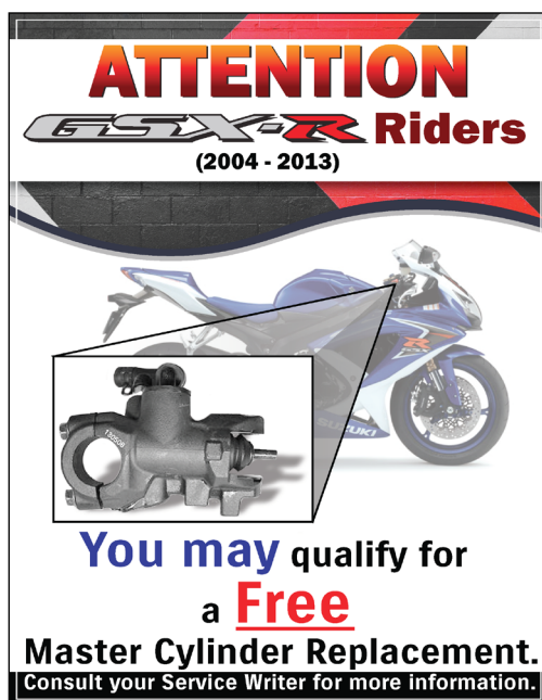
Laminated Countertop Card Side 1

For complete information about the GSX-R Front Brake Master Cylinder Safety Recall and repair instructions, please refer to GS/GSX/GSX-R No. 228 .