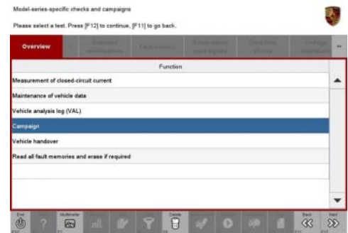
Additional menu – Campaign

You are then prompted to enter a start code.