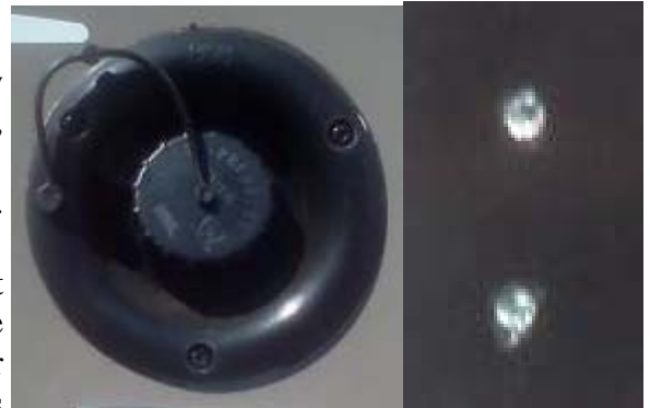
Fig. 1— Fresh water tank fill.