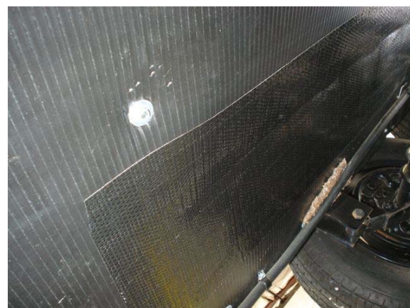
Fig. 6—Reseal the underbelly.