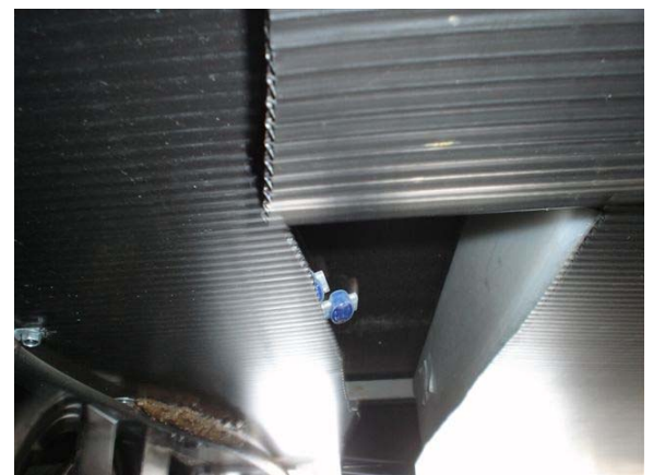
Fig. 3 — Access in the underbelly to install cross brace bracket.