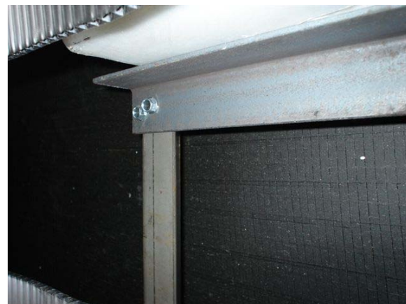
Fig. 5—Install cross brace bracket.