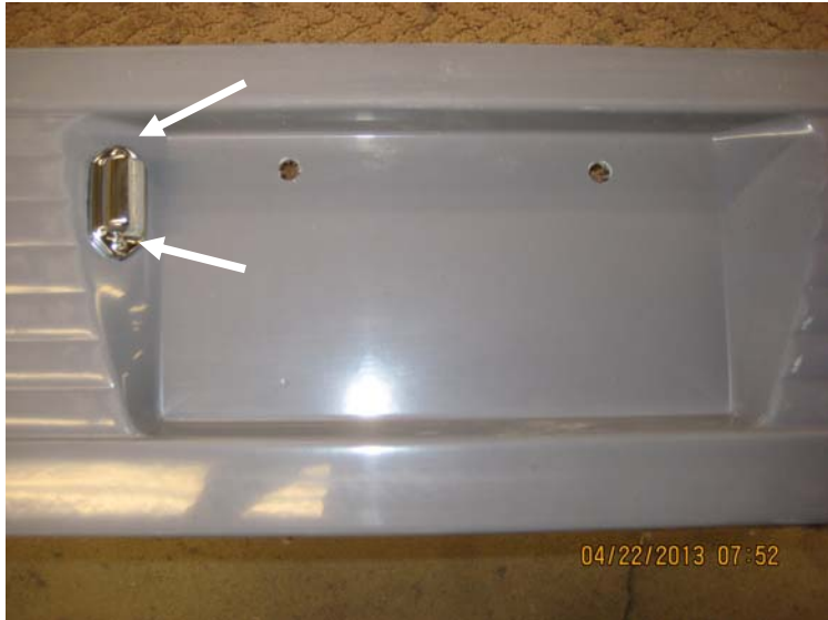
Exterior Photo (#1)