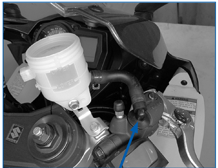
(2007 GSX-R1000 Shown) Front Brake Master Cylinder LATER STYLE

Reservoir hose exits from the top of the master cylinder assembly.