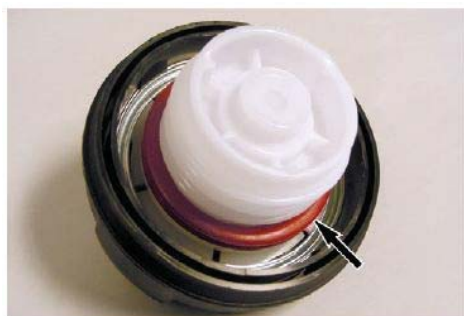
NEW IMPROVED FUEL CAP – REDDISH SEAL

For reference, please see below pictures that will help you identify that the fuel cap on your vehicle is the improved version. The improved fuel cap has a reddish color seal and a different size handle. If your vehicle is equipped with the improved version, no further action is needed.