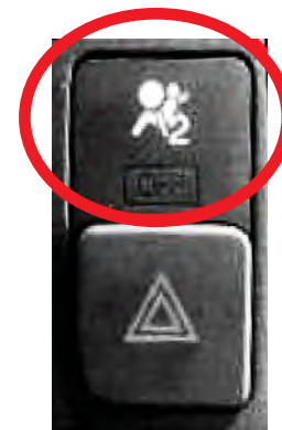
NOT CORRECT Replace the switch.

Correct – If the indicator is correct, no repair is necessary.